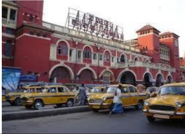
Howrah Parcel office

Central Application CRIS New Delhi 1 st July 2006