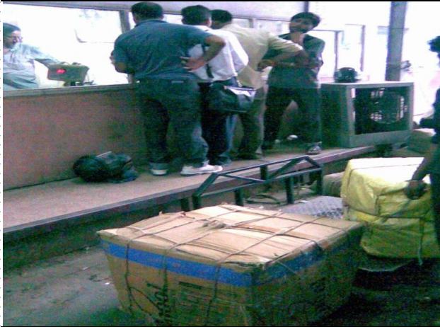
New Delhi Parcel office